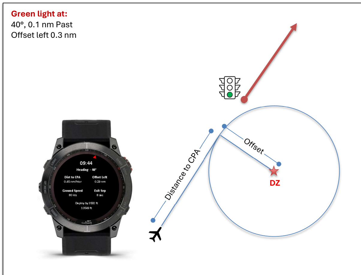
Figure 4: Closest Point of Approach Visualization, the watch face is an example of what would be displayed for a user in the plane.

The Deploy by calculation is based off the user input glide ratio and descent rate in addition to the wind model. If you are unsure of what your glide ratio is, utilize the normalized glide ratio while under canopy on the canopy screen while flying steadily and input that into the app.