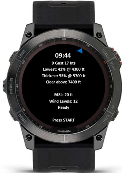
Figure 2: Ready / weather-loaded example