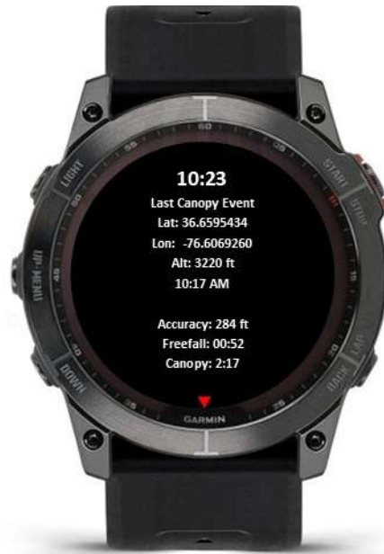
Figure 7: Review Screen Example