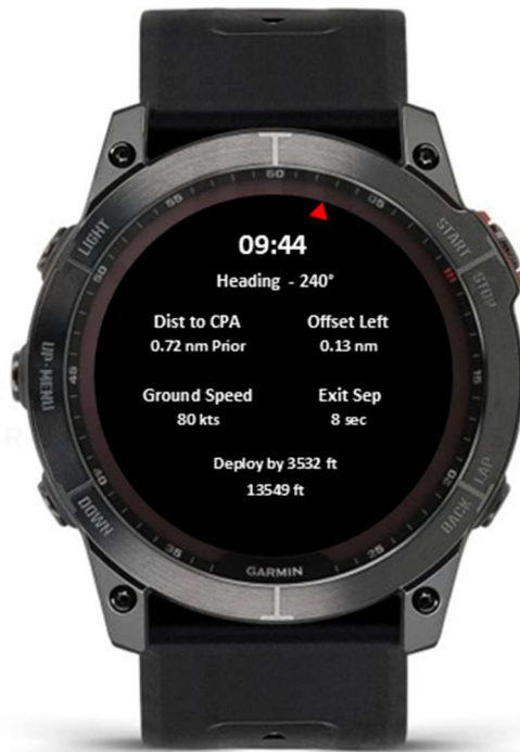
Figure 3: Spot Screen Example