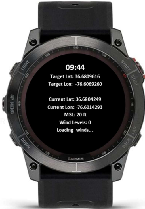
Figure 1: Startup / pre-weather example