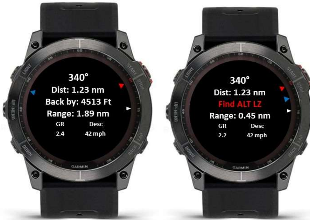
Figure 5: Canopy screen examples. The left watch is portraying a canopy that has enough glide in the current conditions to reach the target. The right watch portrays a canopy that does not have enough glide in the current conditions to reach the target.